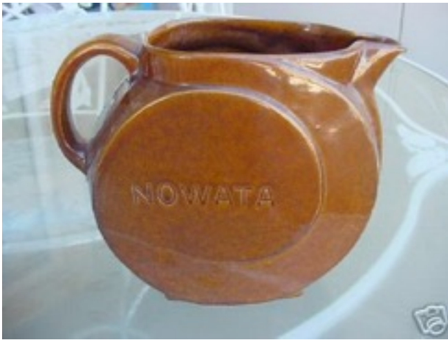
The #4D pitcher was used for Nowata Oklahoma.