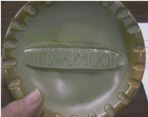
One of the more interesting items that Frankoma did was the #457 Broadmoor ashtray. It was done in a variety of colors, and some people think that Frankoma never did this item. But there are examples of this piece that could sway people one way or another. The color was not a Frankoma color, or the clay is just not right. I think that Frankoma, and other pottery makers did this item. That is where the confusion arises.