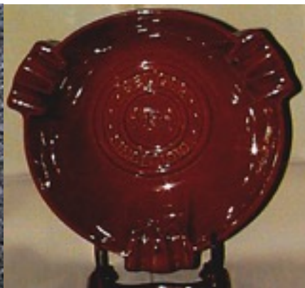
Frankoma used the #458 ashtray to do advertising for companies. You can find this item in many different colors and advertisers.